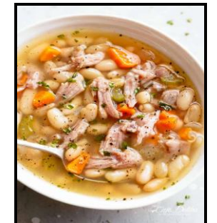
Men's Bean Dinner Heath Church of Christ March 19 th

A set of bus keys and an appliance dolly are both missing from the church. If you have borrowed either of these, please return to the church as soon as possible.